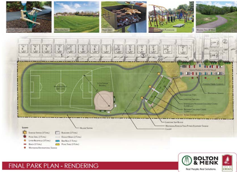
FINAL PARK PLAN - RENDERING

The park is unique to Jordan and all of Scott County, in that it will contain two 'ninja warrior' style challenge course playgrounds, complete with push button activated timer/scoreboard. The park will also house an additional ball-field for softball or baseball, an overlapping soccer field, a new trail loop, and other amenities and greenspace.